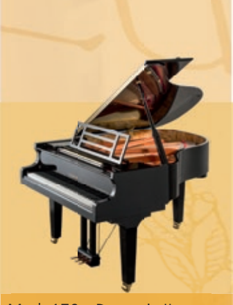
Mod. 179 - Dynamic II