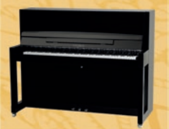
Mod. 115 - Premiere