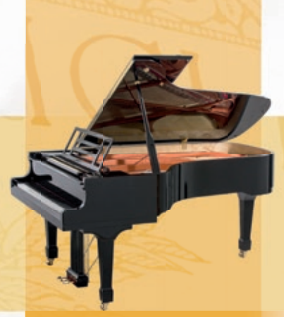
Mod. 218 - Concert I