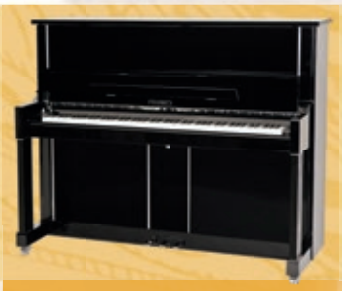
Mod. 125 - Design