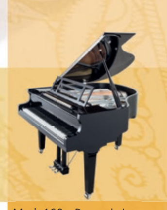
Mod. 162 - Dynamic I