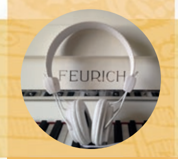
Silencer Systems for all models