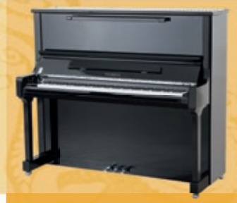
Mod. 133 - Concert